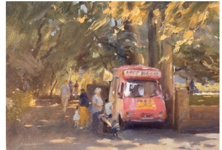
Ice Cream, Marble Hill