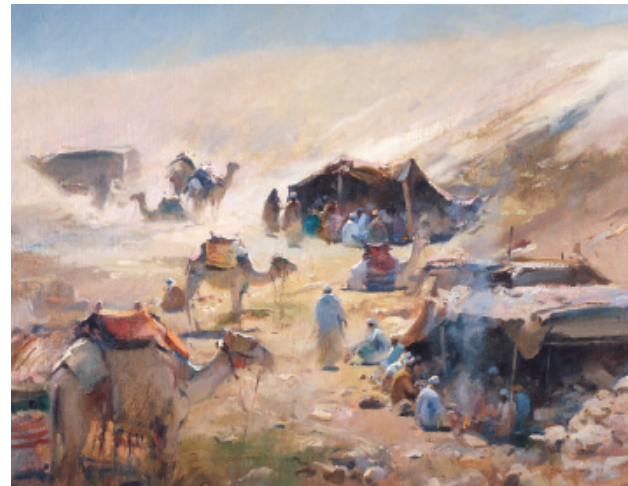
Bedouin Encampment, Near Cairo