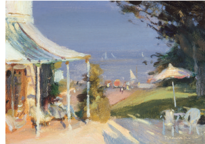
Evening, The Royal Glen, Sidmouth