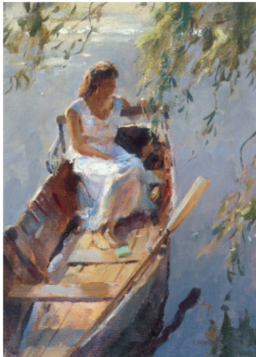
Angie in a White Dress Oil 14" x 10"